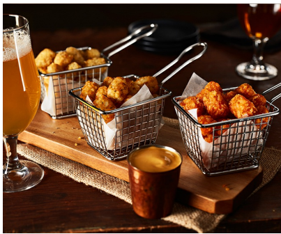
Seasoned Tots Trio