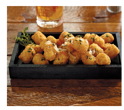
Rosemary Parmesan Tots