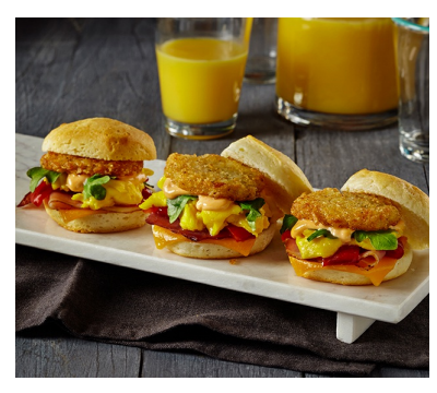
Smoked Ham Breakfast Biscuits