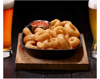
Beer Battered Rings with Kimchi