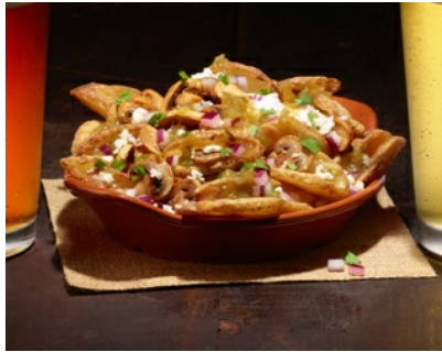
Dip n-Quiles with Mushrooms