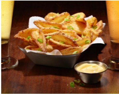
Far East Vs