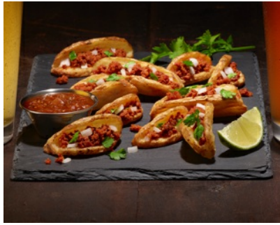
Potato Chorizo "Tacos"