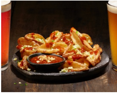
Pad Thai Taters