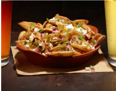
Dip n-Quiles with Mushrooms