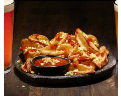
Pad Thai Taters