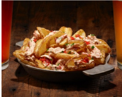
Patatas con Pollo