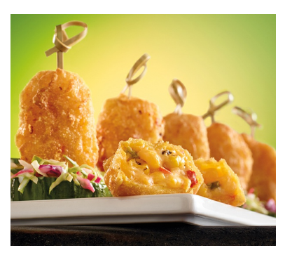
Southwestern Heat Stacks