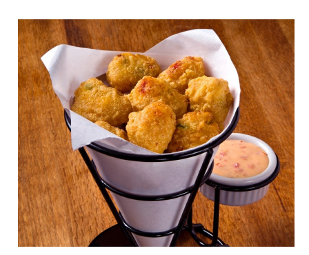
Corn Nugget Cone